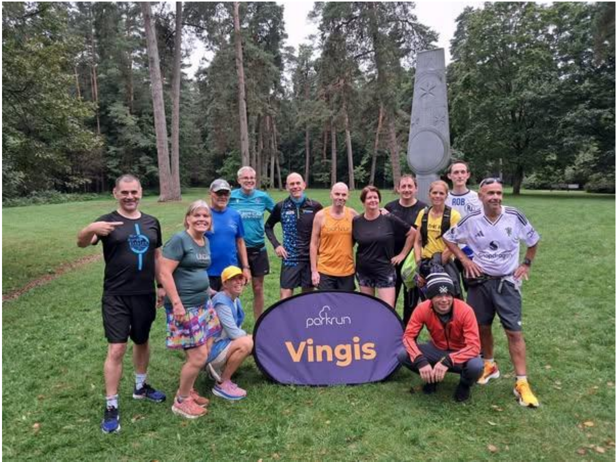
▲ Roadrunners at Vingis Parkrun, Lithuania, 13 Sept