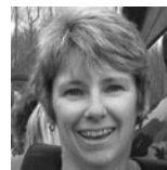
CATHERINE LEATHER CLUB EX-OFFICIO